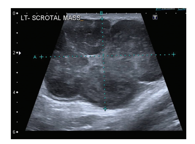
FIG. 1 and FIG. 2 Scrotal ultrasound demonstrating left paratesticular mass.